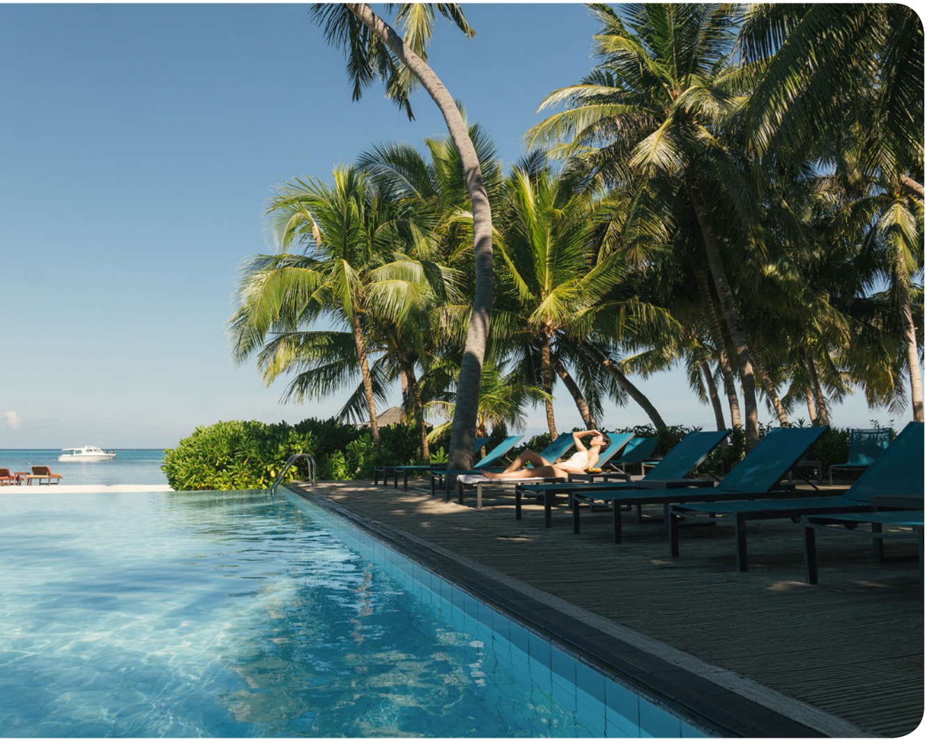
Main swimming pool Outdoor pool