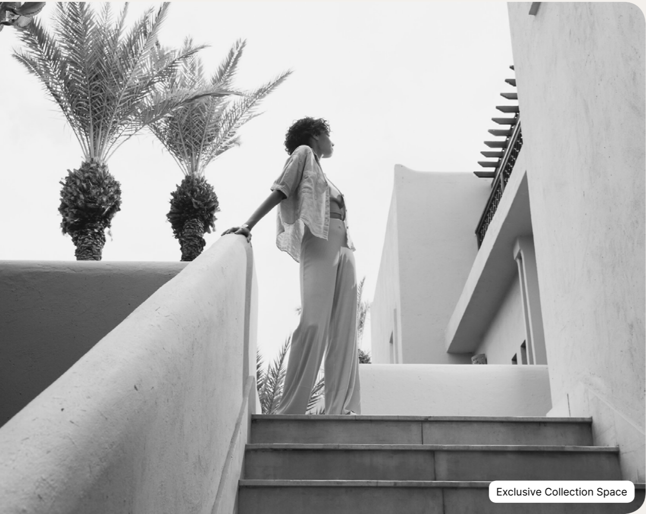
Exclusive Collection Space