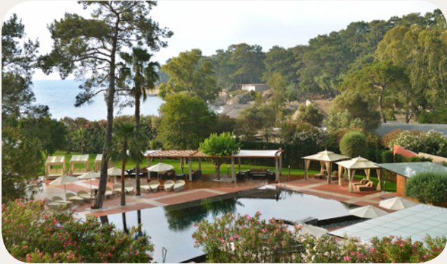
Zen Pool Hotel Outdoor pool

This freshwater pool with hot tub near the hotel welcomes you throughout the day. Access only for adults over 18. . Heated – At the beginning and end of the season.