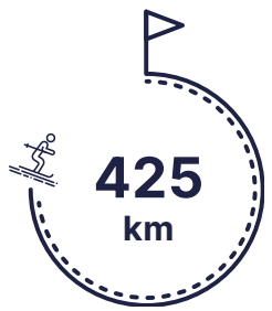
Alpine ski slopes