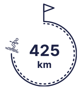
Alpine ski slopes