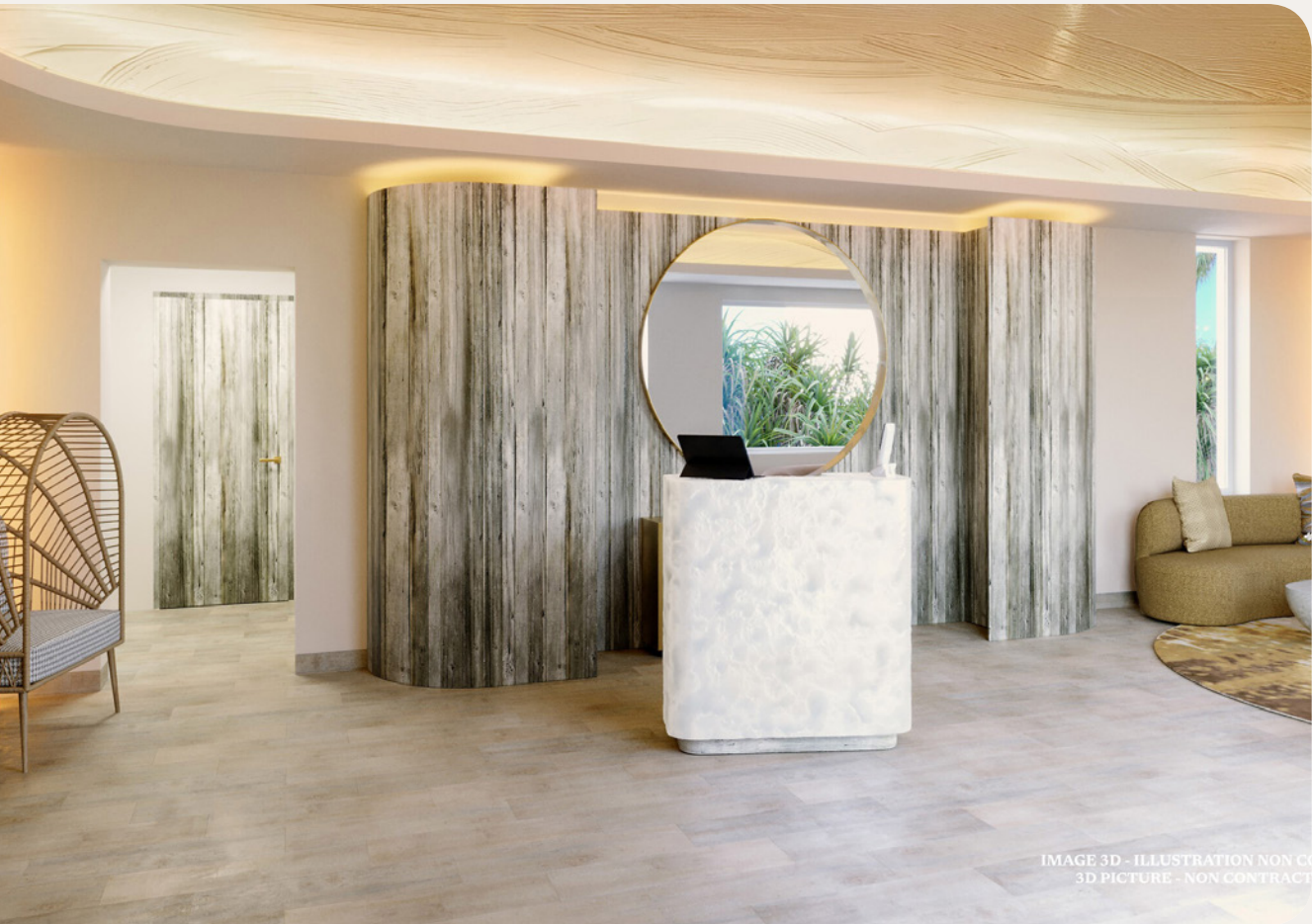
IMAGE 3D - ILLUSTRATION NON CONTRACT 3D PICTURE - NON CONTRACT

Sothys, a prestigious brand enhancing the art of professional skincare with technology, sensoriality and naturality, embodies French excellence since 1946. Terres d'Afrique rituals blend science and tradition. Ethical therapies inspired by African plants, celebrating the connection between health and nature.