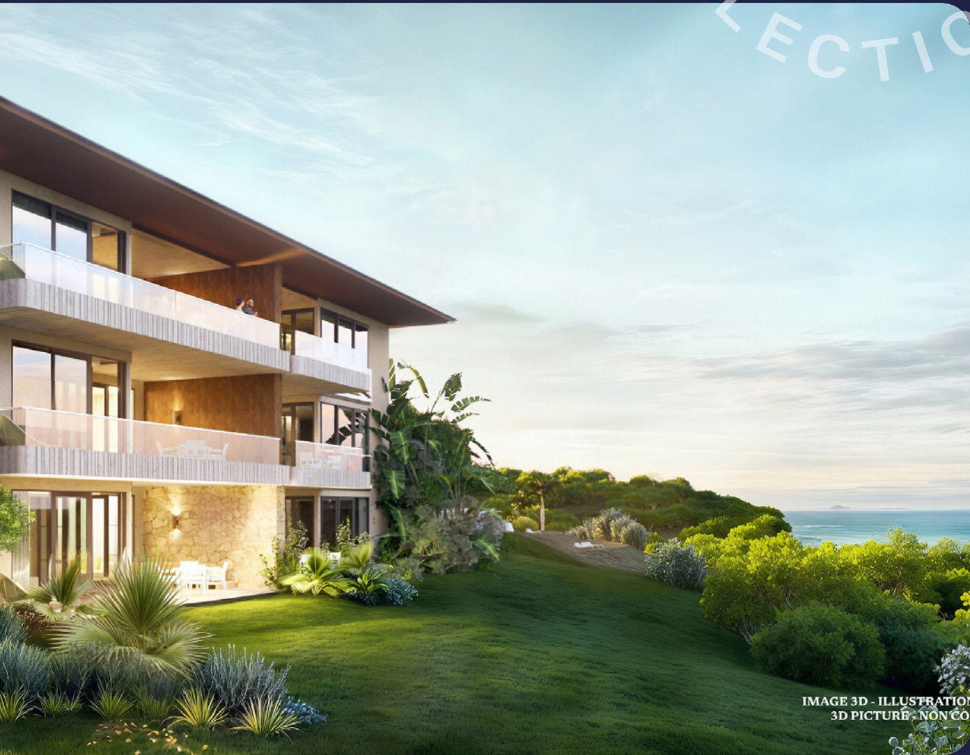
IMAGE 3D - ILLUSTRATION 3D PICTURE - NON CONTRACTUAL

Enjoy a unique and intimate experience in the Exclusive Collection Space.