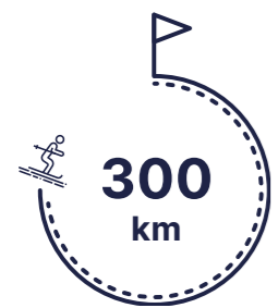
Alpine ski slopes