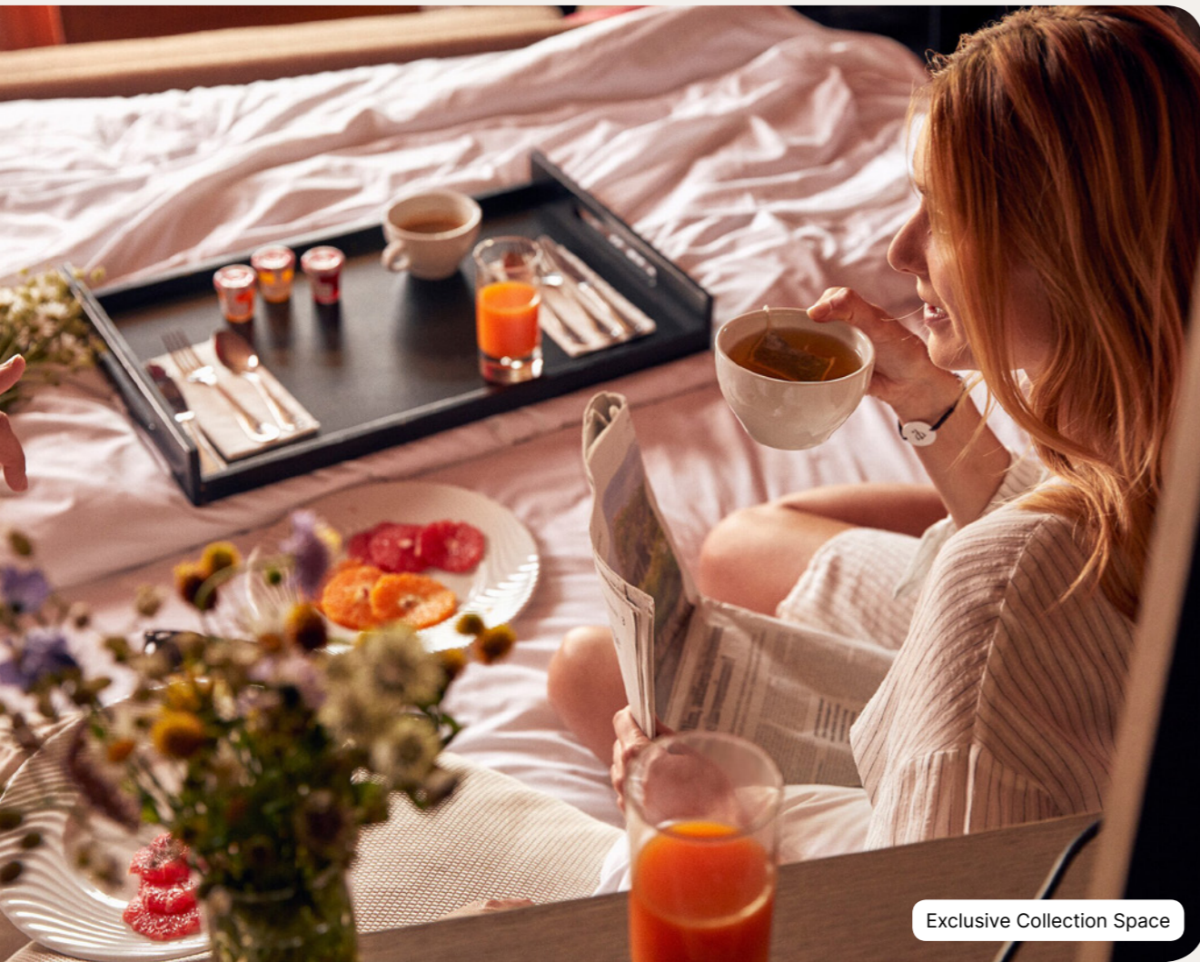
Exclusive Collection Space