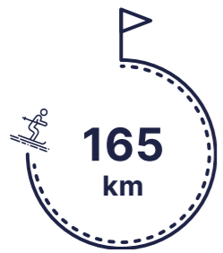
Alpine ski slopes