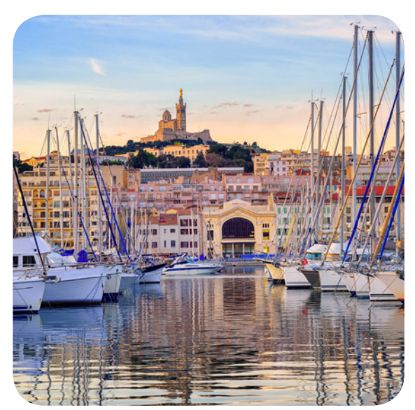
Day 1: Boarding from 16h to 18h Day 4: Landing from 9h to 11h