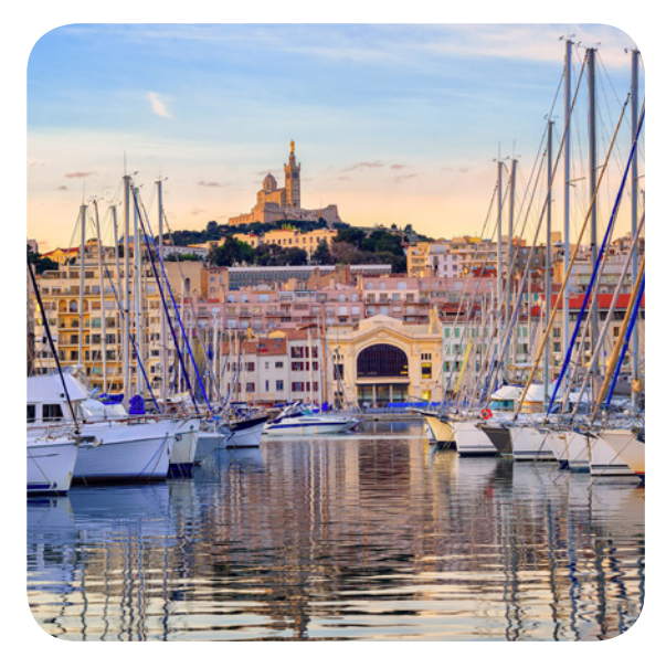
Day 1: Boarding from 16h to 18h Day 5: Landing from 9h to 11h