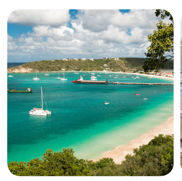
Day 1: Boarding from 16h to 20h Day 8: Landing from 9h to 11h