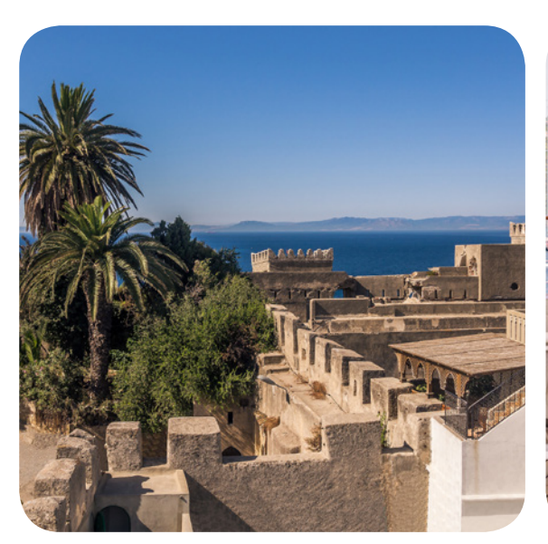
Day 1: Boarding from 16h to 20h Day 8: Landing from 9h to 11h