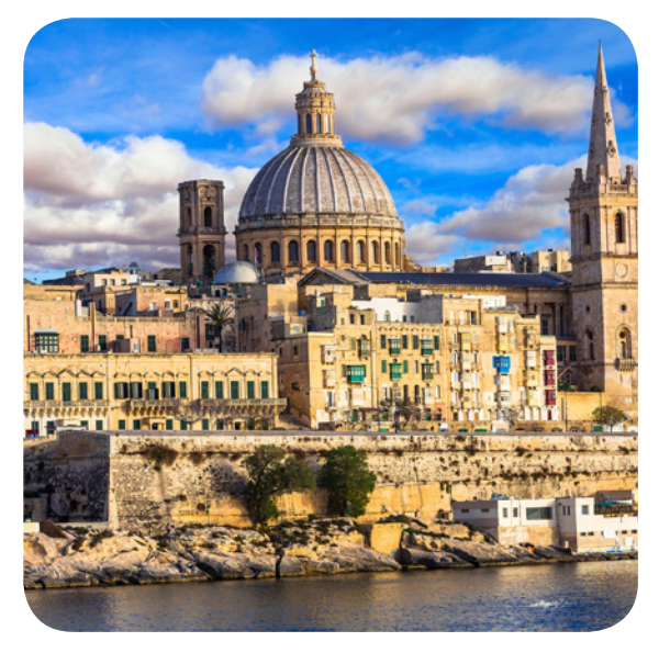
Day 1: Boarding from 16h to 18h Day 8: Landing from 9h to 11h