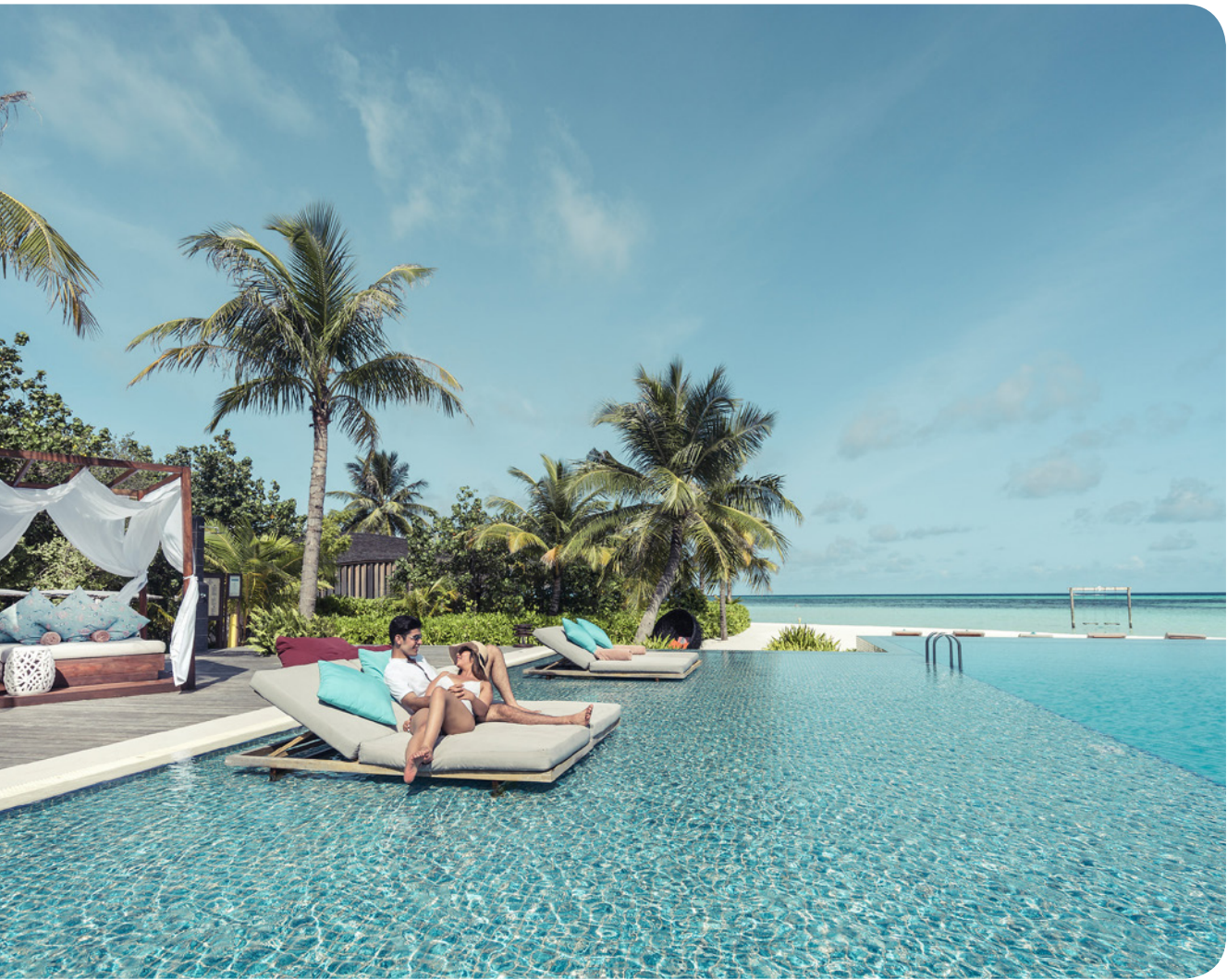
Main swimming pool Outdoor Pool