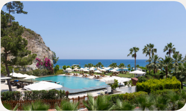
Zen Pool Villagio Outdoor Pool

Located alongside the beach, near the waterskiing area and not far from the children's club facilities, this pool is reserved for adults over 18. Heated – At the beginning and end of the season.