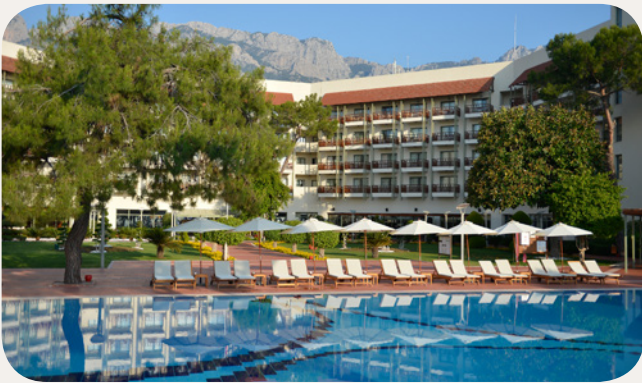
Outdoor hotel pool Outdoor Pool

This fresh water overflow pool is located in the hotel, with a shallow-end area for kids. Children are under the supervision of their parents or an accompanying adult. Heated – At the beginning and end of the season.