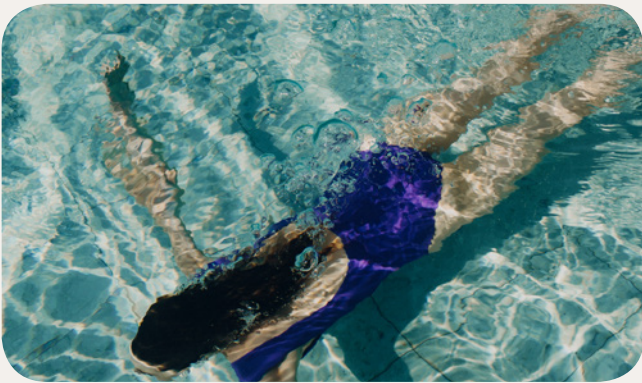
Indoor Pool Indoor Pool

Available from Resort opening until May 1st, then from October 1st to Resort closing. Freshwater pool reserved for adults and close to the hotel Spa. Depth (min/max): 1.7m / 1.7m