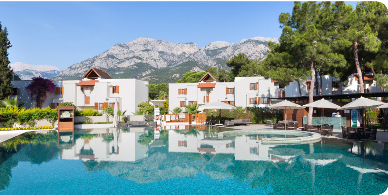
Main swimming pool Villagio Outdoor Pool