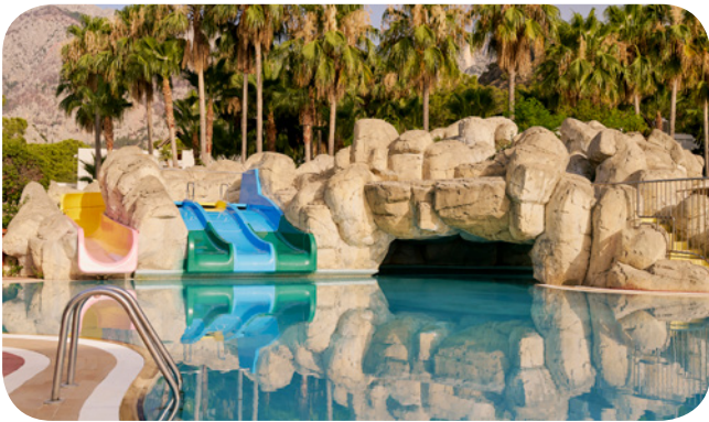
Children’s swimming pool Outdoor Pool

At Baby Club Med, Petit Club Med and Mini Club Med, your children can have fun in the shallow pool and the separate paddling pool. Young G.Ms love cooling off in the water, whether they are playing games, trying sports and slides, or simply relaxing. Heated – At the beginning and end of the season.