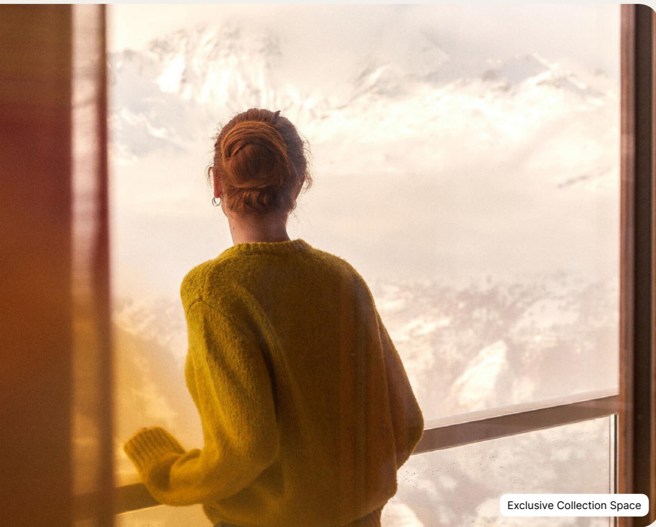
Exclusive Collection Space