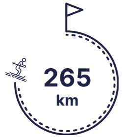
Alpine ski slopes