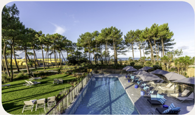
Zen Pool Outdoor pool

Fancy sunbathing quietly beside a pool? Located in the 'Dunes' area, the quiet pool for adults only is the perfect place to chill out, top up your tan, read in the shade of a parasol or swim a few lengths. There's even a bar nearby if want a nice cold drink.