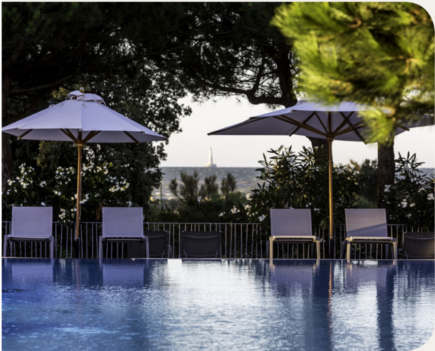
Main swimming pool Outdoor pool

This fresh water overflow pool is ideally located in the heart of the Resort.