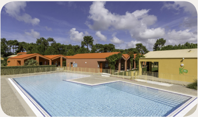
Children's swimming pool Outdoor pool

At Petit Club Med and Mini Club Med, your children can have fun in the paddling pool and shallow pool. Young G.Ms love cooling off in the water, whether they are playing games, trying sports or simply relaxing.