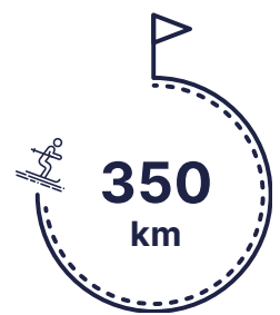
Alpine ski slopes