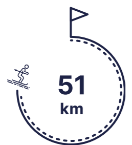
Alpine ski slopes